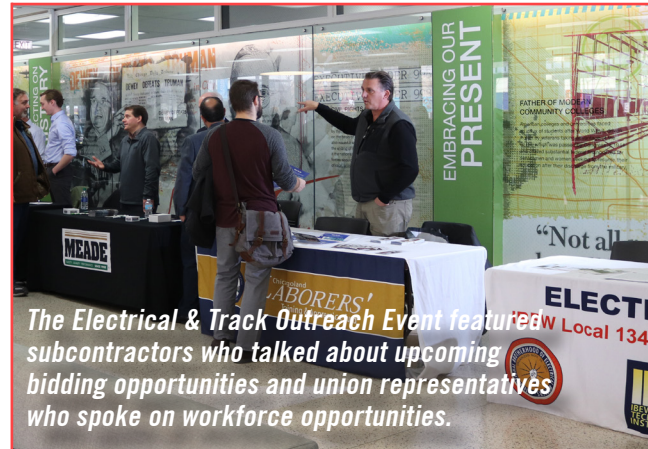
The Electrical & Track Outreach Event featured subcontractors who talked about upcoming bidding opportunities and union representatives who spoke on workforce opportunities.